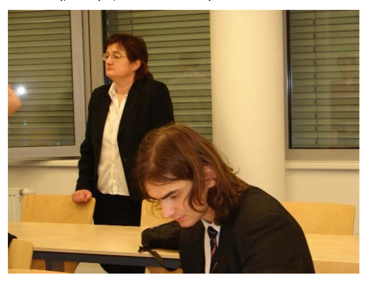
DAY 1: Monday, February 5<sup>th</sup>, lectures at the University of Economics